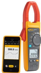
Fluke #376 FC