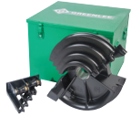
SHOE GROUP, PVC-CTD RGD 1/2-2 Part# 12586