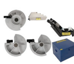
SHOE GROUP, 700 STYLE, RIGID 1/2" - 2" Part# 700R