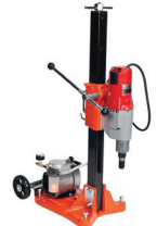
NORTON CLIPPER CORE DRILL RIG Part# DR520