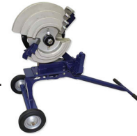
753 MECHANICAL BENDER Part# 753