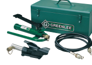
HYDRAULIC CABLE BENDER W/PUMP Part# 800F1725