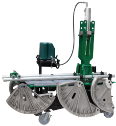
BENDER, HYD 881 W/ TBLE & PUMP Part# 881GXE980MBTS