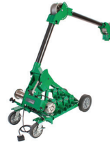
UT10 PULLER PACKAGE W/MVB + ADAPTERS Part# 6906A