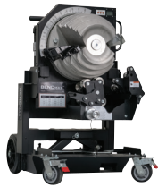
BENDER, POWER 2 IN (BENDS RIGID/EMT/IMC 1/2-2") Part# PB2000