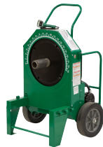
CLASSIC ELECTRIC BENDER POWER UNIT Part# 555C