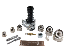
KIT, SET W/ DRIVE UNIT MPXD-SD 1/2-2" FOR STAINLESS STEEL Part# MPXD-SD