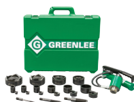
HAND PUMP HYD, SB, 1/2" - 4" Part# 7310SB