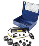
1/2-4" KNOCKOUT SET Part# 154PM