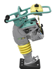
JUMPING JACK Part# ATR 68 C