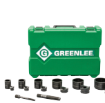
QUICK DRAW 90, SB, 1/2" - 2" Part# 7906SB