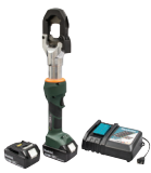
CUTTER WIRE, ACSR 45MM STD, 120V Part# ESG45LX11