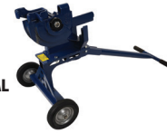
750 MECHANICAL BENDER Part# 750