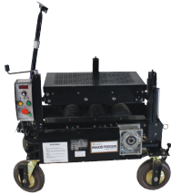
FEEDER, CABLE MAXIS MCF-01 Part# MCF 1