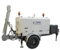
HALER KE-SP 3050 CABLE PULLER Part# KE-SP 3050