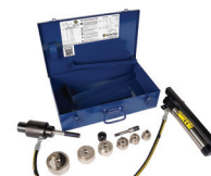
1/2-2" KNOCKOUT SET FOR STAINLESS STEEL Part# 161SS