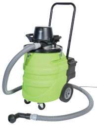
POWER FISHING SYSTEM (15' HOSE) Part# 690-15