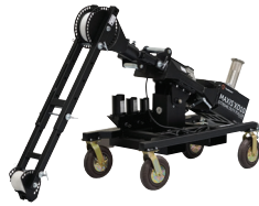
MAXIS XD10 EXTREME DUTY CABLE PULLER Part# XD10