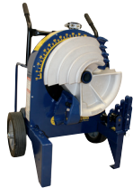
ELECTRIC BENDER FOR 1/2" - 2" CONDUIT Part# 77