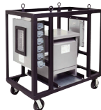
3-PHASE TRANSFORMER POWER STATION, 4 WHEELS, 480V 3P4W TO 120/208V 45PW, 15KVA TRANSFORMER Part# 6220PDC75