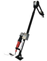
PULLER, CABLE M6K-M MAXIS 6K W/ MOTOR Part# M6K-M