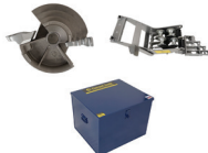
1/2 TO 2" EMT SINGLE SHOE GROUP Part# 700SE