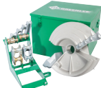
SHOE GROUP, EMT 1/2 - 2 Part# 23803