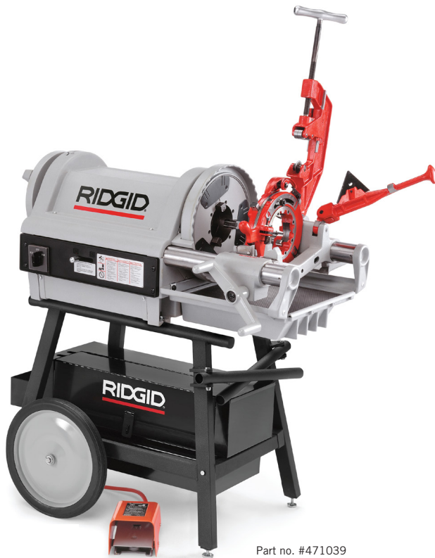
Part no. #471039