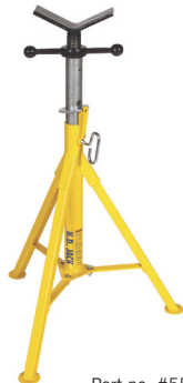
Part no. #559642