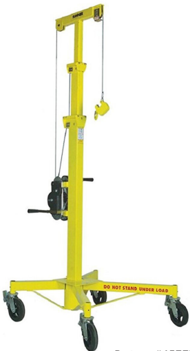
Part no. #457771