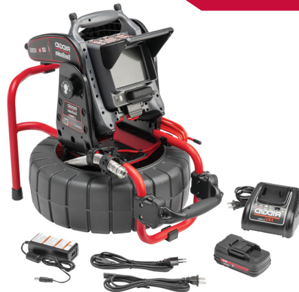
Part no. #479177