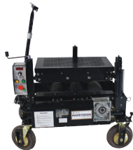
FEEDER, CABLE MAXIS MCF-01 Part# MCF 1