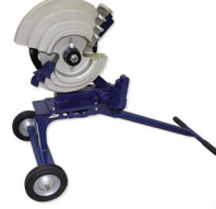
753 MECHANICAL BENDER Part# 753