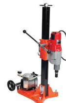
NORTON CLIPPER CORE DRILL RIG Part# DR520