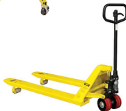
27" x 48" 6,600 LB CAPACITY PALLET JACK Part# PJ27