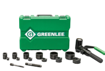
QUICK DRAW 90, SB, 1/2" - 2" Part# 7906SB