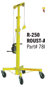
R-250 ROUST-A-BOUT Part# 780303