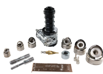
KIT, SET W/ DRIVE UNIT MPXD-SD 1/2-2" FOR STAINLESS STEEL Part# MPXD-SD