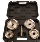
DIE, SET LARGE 2-1/2"-4" FOR STAINLESS STEEL Part# MP-03PRO