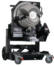
BENDER, POWER 2 IN (BENDS RIGID/EMT/IMC 1/2-2") Part# PB2000