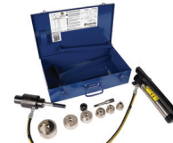
1/2-2" KNOCKOUT SET FOR STAINLESS STEEL Part# 161SS