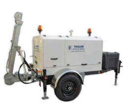
HALER KE-SP 3050 CABLE PULLER Part# KE-SP 3050