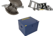
1/2 TO 2" EMT SINGLE SHOE GROUP Part# 700SE