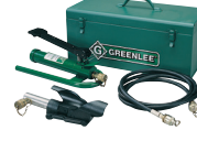
HYDRAULIC CABLE BENDER W/PUMP Part# 800F1725