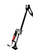
PULLER, CABLE M6K-M MAXIS 6K W/ MOTOR Part# M6K-M