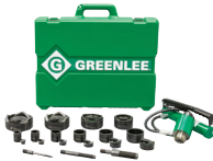
HAND PUMP HYD, SB, 1/2" - 4" Part# 7310SB