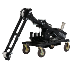
MAXIS XD10 EXTREME DUTY CABLE PULLER Part# XD10