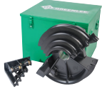
SHOE GROUP, PVC-CTD RGD 1/2-2 Part# 12586