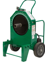
CLASSIC ELECTRIC BENDER POWER UNIT Part# 555C