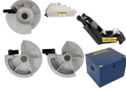
SHOE GROUP, 700 STYLE, RIGID 1/2" - 2" Part# 700R