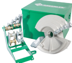
SHOE GROUP, EMT 1/2 - 2 Part# 23803