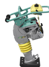
JUMPING JACK Part# ATR 68 C