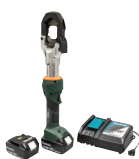
CUTTER WIRE, ACSR 45MM STD, 120V Part# ESG45LX11