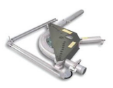
BENDER, HYD-COND (1-1/4x5) Part# 885